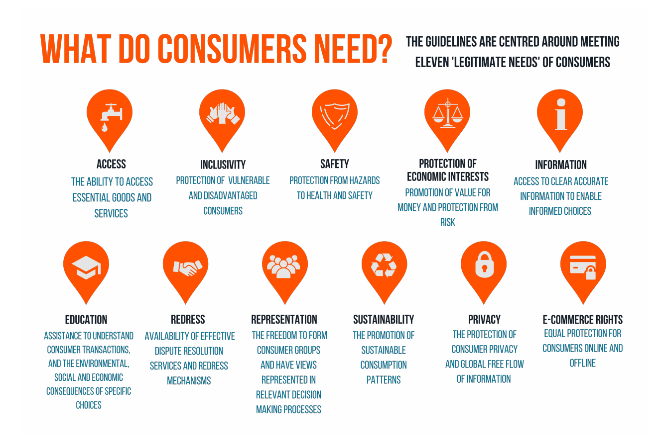
Figure 3. The 11 legitimate consumer needs.

International collaboration on consumer protection is guided by eleven 'legitimate needs' (see Figure 3), set out in the UN Guidelines for Consumer Protection,<sup>44</sup> which should be met through consumer protection measures. The consumer journey framework (see Figure 2), helps in understanding these high-level needs from the consumer perspective, and how these relate to the specific challenges and barriers faced by consumers in adopting practices aligned with clean energy transitions.