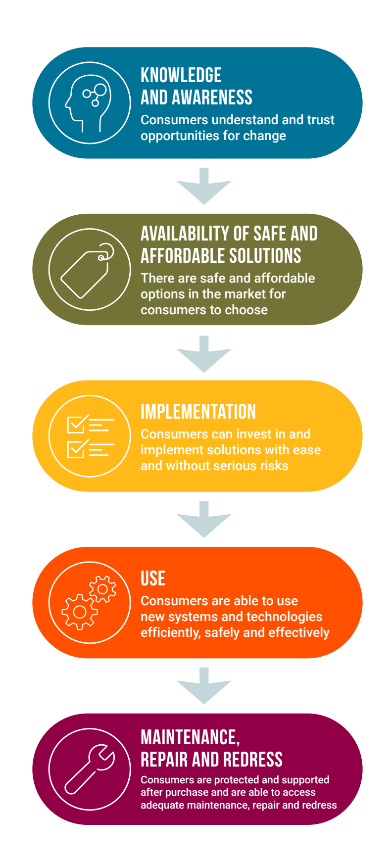
Figure 2. Building confidence and trust in the consumer journey

With respect to their ability to adopt sustainable energy practices, consumers may miss opportunities or face barriers relating to these stages of the consumer journey, depending on national and local circumstances and across different groups of consumers. In this paper, we look at the potential for consumer protection and empowerment to address these.